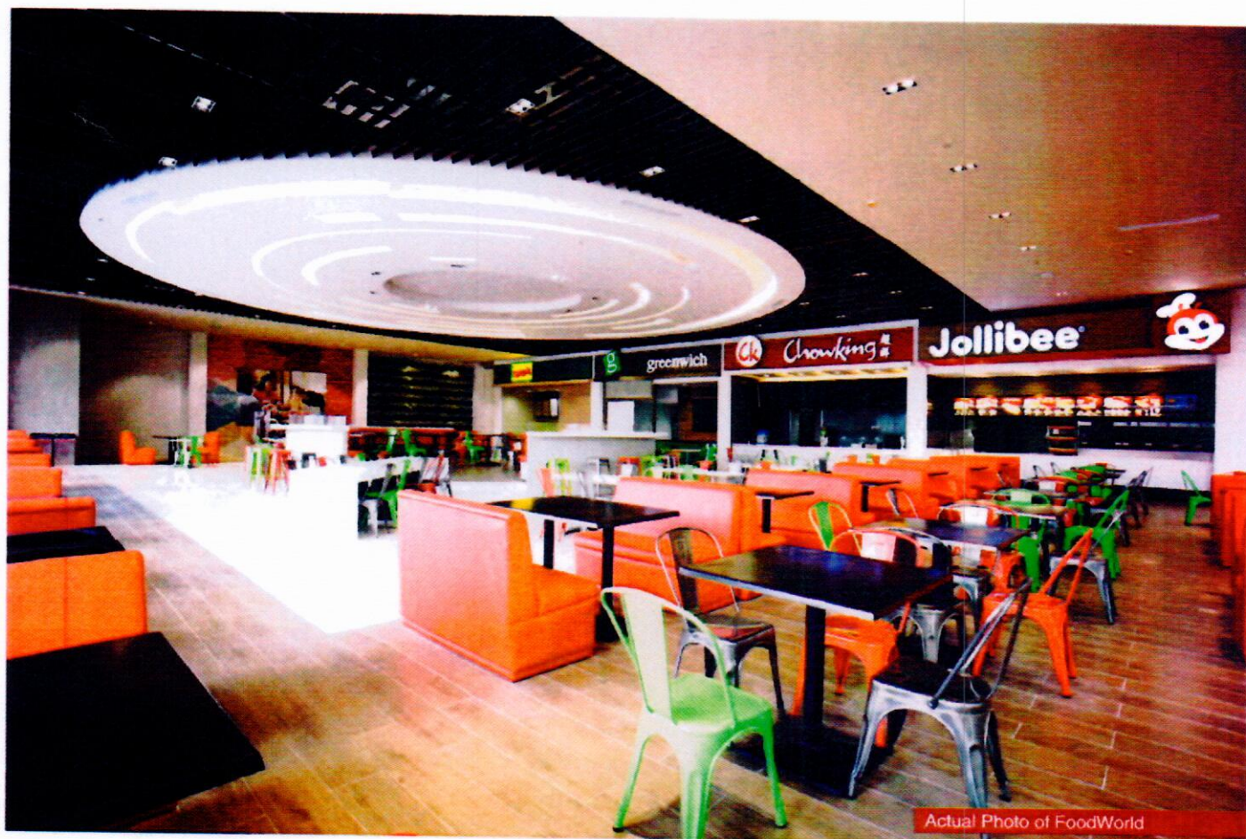
Actual Photo of FoodWorld