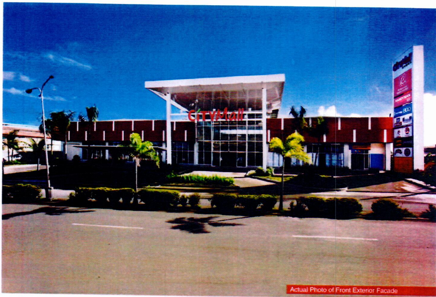
Actual Photo of Front Exterior Facade