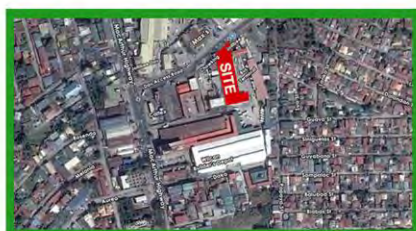
CityMall - Dau, Pampanga