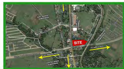
CityMall - Ungka, Pavia Iloilo