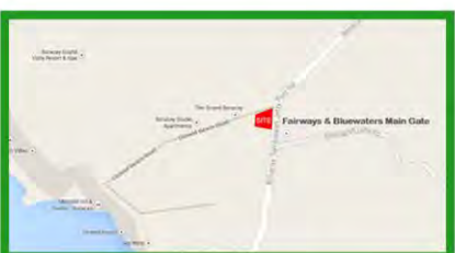
CityMall - Boracay