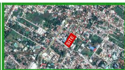
CityMall - Cotabato