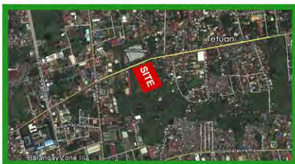
CityMall - Tetuan, Zamboanga