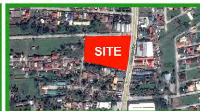
CityMall - Tarlac City