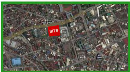
CityMall - Bacalso, Cebu