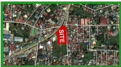
CityMall - Guiwan, Zamboanga