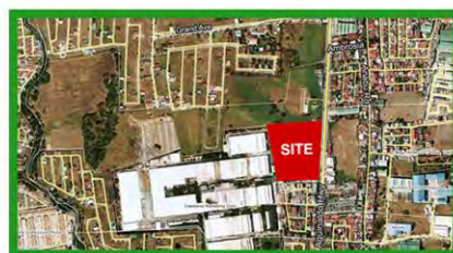
CityMall - Anabu, Imus Cavite