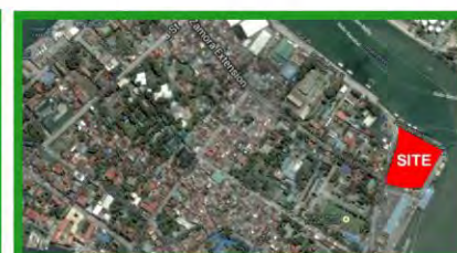
CityMall - Parola, Iloilo