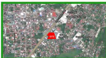
CityMall - Tagum City