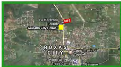
CityMall - Arnaldo, Roxas