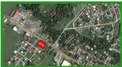
CityMall - Tagbak, Jaro Iloilo