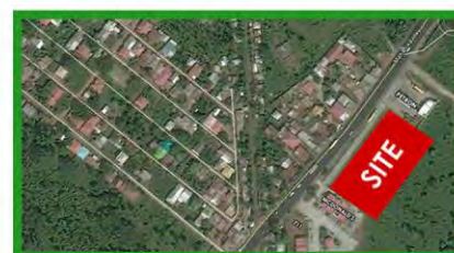
CityMall - Tiaong, Quezon