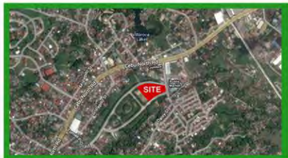
CityMall - Consolacion, Cebu