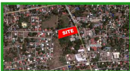
CityMall - Dumaguete City