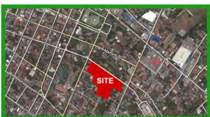
CityMall - Kalibo, Aklan