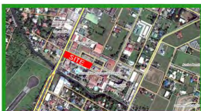
CityMall - Goldenfields, Bacolod